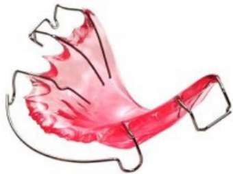
Example of a Hawley retainer

Since you have had your braces removed, you will now be required to wear a retainer. Retainers are worn to hold the teeth in their newly corrected position. This is a critical part of your orthodontic treatment because if you do not wear your retainer, then your teeth can end up moving back to their original position!